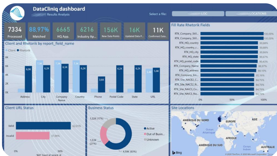
Sample DataCliniq report dashboard